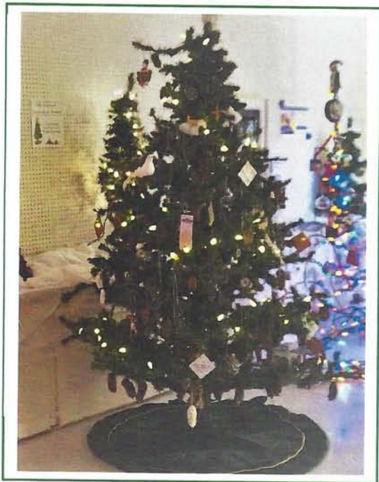
The Trails Society Tree at the Festival of Trees

Suzie walked and documented all of the local trails in town taking many photos of the infrastructure and existing and missing signage. We need to ensure that all of the trails on an old City map are approved so that they can be included in the Armstrong Spallumcheen Info and Trails Map.